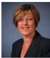
Lisa Neville MP

For assistance on any issue please ring the electorate office on (03) 5248 3462