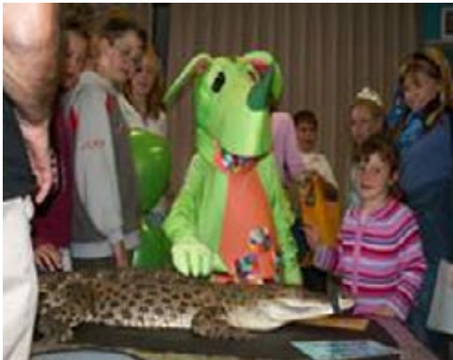
The Bunyip with a crocodile from 'Roaming Reptiles'

I had some fairy floss. I went into the gym at school.