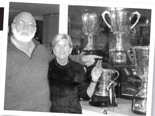
Even Hawks & Bombers supporters admired the Premiership Cups at Skilled Stadium.