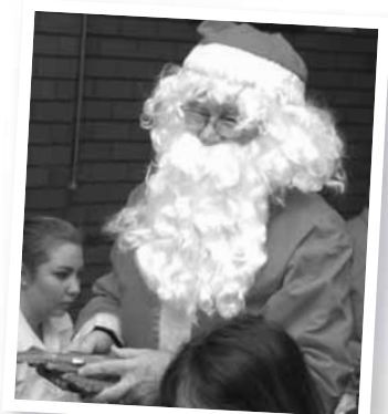
Right: Santa bringing the Christmas spirit to a very enjoyable and charitable event.