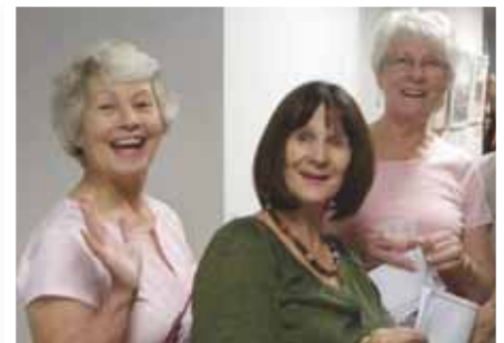
Supportive friends at the exhibit