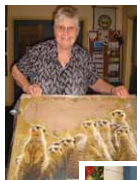
When the Jigsaw arrived