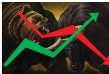
What is a Bear or a Bull market?

Register your interest in SpringDale's proposed Financial Industry Literacy Learning class. We'll start with learning the basics of 'Finance 101', moving through the various levels and areas of the financial