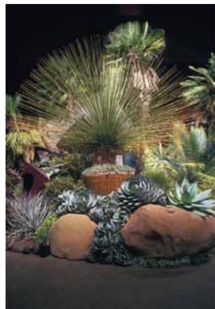
Picture of plants that could be used in the base of the fountain.