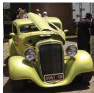
Winner of the Classic section 34 Chev