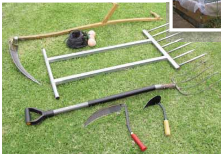
Left: From top. scythe, wetpots, broadfork, hayfork, sickle, ho-mi