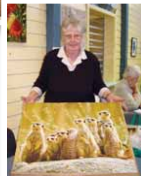
The Jigsaw completed

Everyday a new question. Just before Christmas an almost completed jigsaw puzzle arrived and we were asked would someone like to finish it. Within hours the jigsaw had been adopted and within days it had been completed. Thank you to those who pose the challenges and thank you to those who accept them. What will we be asked to do next?